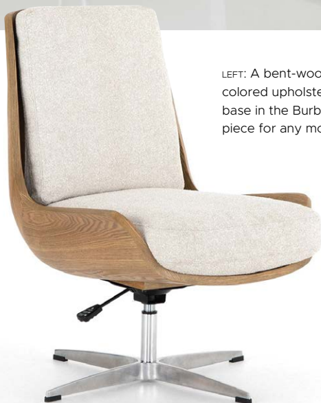
LEFT: A bent-wood back of toasted ash cradles sand-colored upholstered seating atop an adjustable steel base in the Burbank chair by FRANCE & SON , an ideal piece for any modern office. franceandson.com