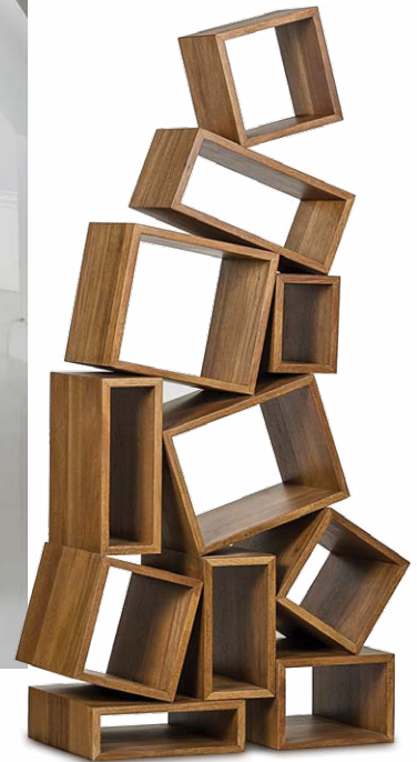
ABOVE: Made of properly dried solid wood, the Cubist bookcase by NOIR FURNITURE is the most exciting thing to happen to home offices since Zoom. noirfurniture.com