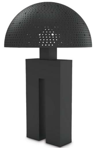
ABOVE: Moroccan details on the shade of the Amur desk lamp by 54 KIBO contrast its modern base. 54kibo.com