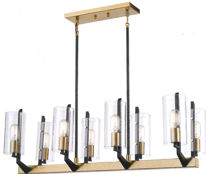
ABOVE: Elk Lighting's angular "Blakeslee" chandelier is styled with satin brass accents and tapering matte black arms that hold eight lights shimmering within clear glass cylinders. 800/613-3261