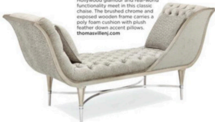
Caracole Living Room "Both Ends Meet" Hollywood glamour and real-world functionality meet in this classic chaise. The brushed chrome and exposed wooden frame carries a poly foam cushion with plush feather down accent pillows. thomasvillenj.com