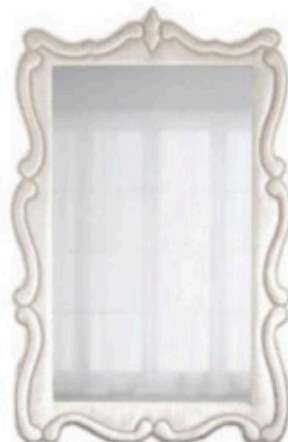
Haute House Silver Antoinette Floor Mirror Delicate in design with a commanding finish, this handcrafted floor mirror draws inspiration from vintage Hollywood glamour, but with a modern touch. $1,899, horchow.com