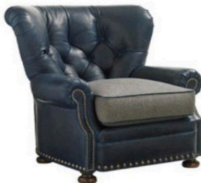
Coventry Hills Elle Wingback Chair An oversized wingback perfect for a home office or man-cave, its rich tufted leather is available only in the deep blue coloring shown above. The contrasting seat cushion makes for a striking accent. $3,520, wayfair.com