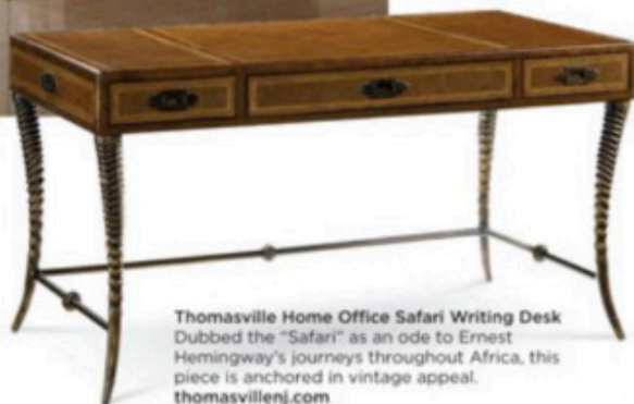
Thomasville Home Office Safari Writing Desk Dubbed the "Safari" as an ode to Ernest Hemingway's journeys throughout Africa, this piece is anchored in vintage appeal. thomasvillenj.com