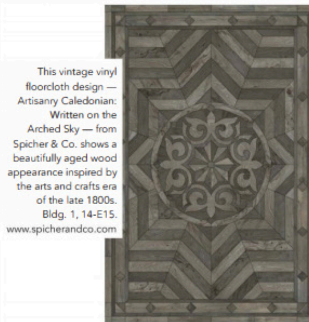
This vintage vinyl floorcloth design — Artisanry Caledonian: Written on the Arched Sky — from Spicher & Co. shows a beautifully aged wood appearance inspired by the arts and crafts era of the late 1800s. Bldg. 1, 14-E15. www.spicherandco.com