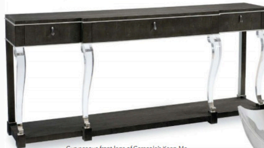
Curvaceous front legs of Caracole's Keep Me Posted console are crafted from acrylic, contrasting the Midnight Maple finish on its Black Curly Maple veneers. Metal accents finished in Polished Chrome. Bldg. 1, 14-C6. www.caracole.com