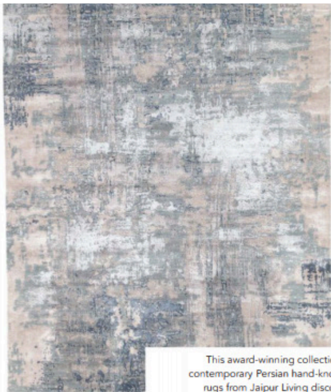
This award-winning collection of contemporary Persian hand-knotted rugs from Jaipur Living discovers beauty in errors. Made of hand-carded wool with viscose, each piece employs 180 artisans to create these exquisite rugs. Bldg. 1, 12-F9. www.jaipurliving.com