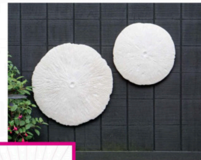
For a beachy touch, look no further than Gold Leaf Design Group's sand dollar wall art — perfect for both indoor and outdoor spaces. Made of stone powder and resin. Bldg. 1, 9-A1. www.goldleafdesigngroup.com