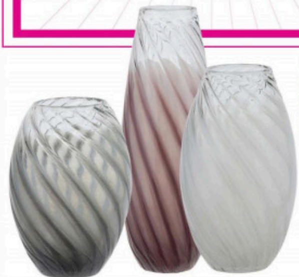
Available in three color choices — clear/white, clear/purple and clear/grey — Viterra's new Spiral Collection of art glass vases comes in a range of sizes from 12 to 18 inches in height. Bldg. 2, 2-100F. www.viterraglass.com