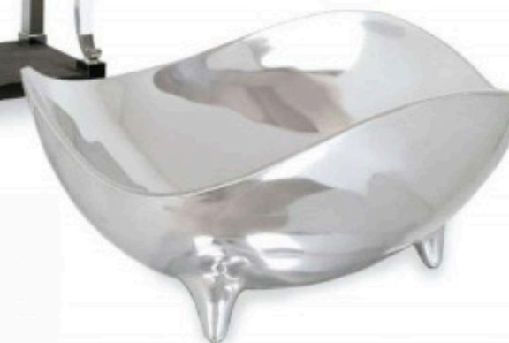
The three-footed Oda bowl is Beatriz Ball's updated take on the Mid-Century Modern style. The design takes inspiration from the best of Danish modern tableware. Bldg. 2, 18-1801. www.beatrizball.com