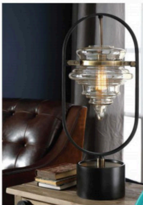
Artistically curved iron paired with subtle industrial influences, Revelation by Uttermost's Boleto is finished in an Aged Black with Antique Brass-plated details, displaying a suspended, uniquely shaped, amber glass shade. Bldg. 1, 12-E2A, G7. www.uttermost.com