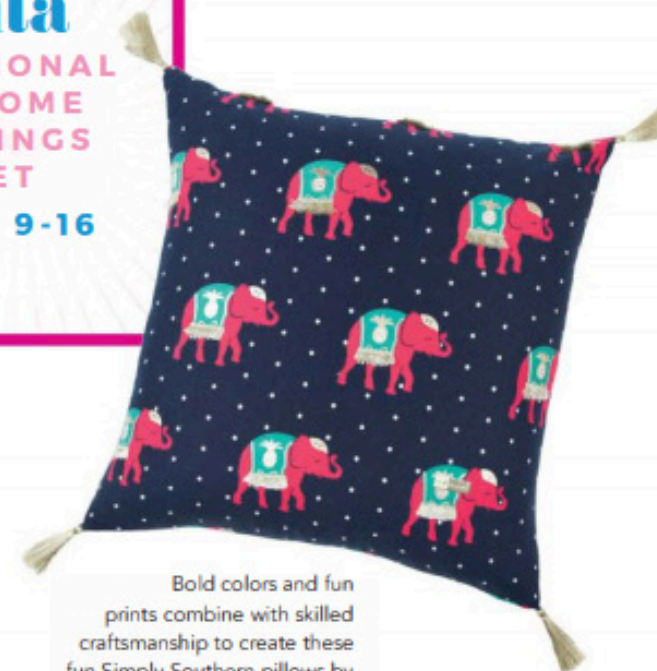
Bold colors and fun prints combine with skilled craftsmanship to create these fun Simply Southern pillows by Rizzy Home. Each pillow is hand-embroidered. Bldg. 1, 6-C3, C8. www.rizzyhome.com