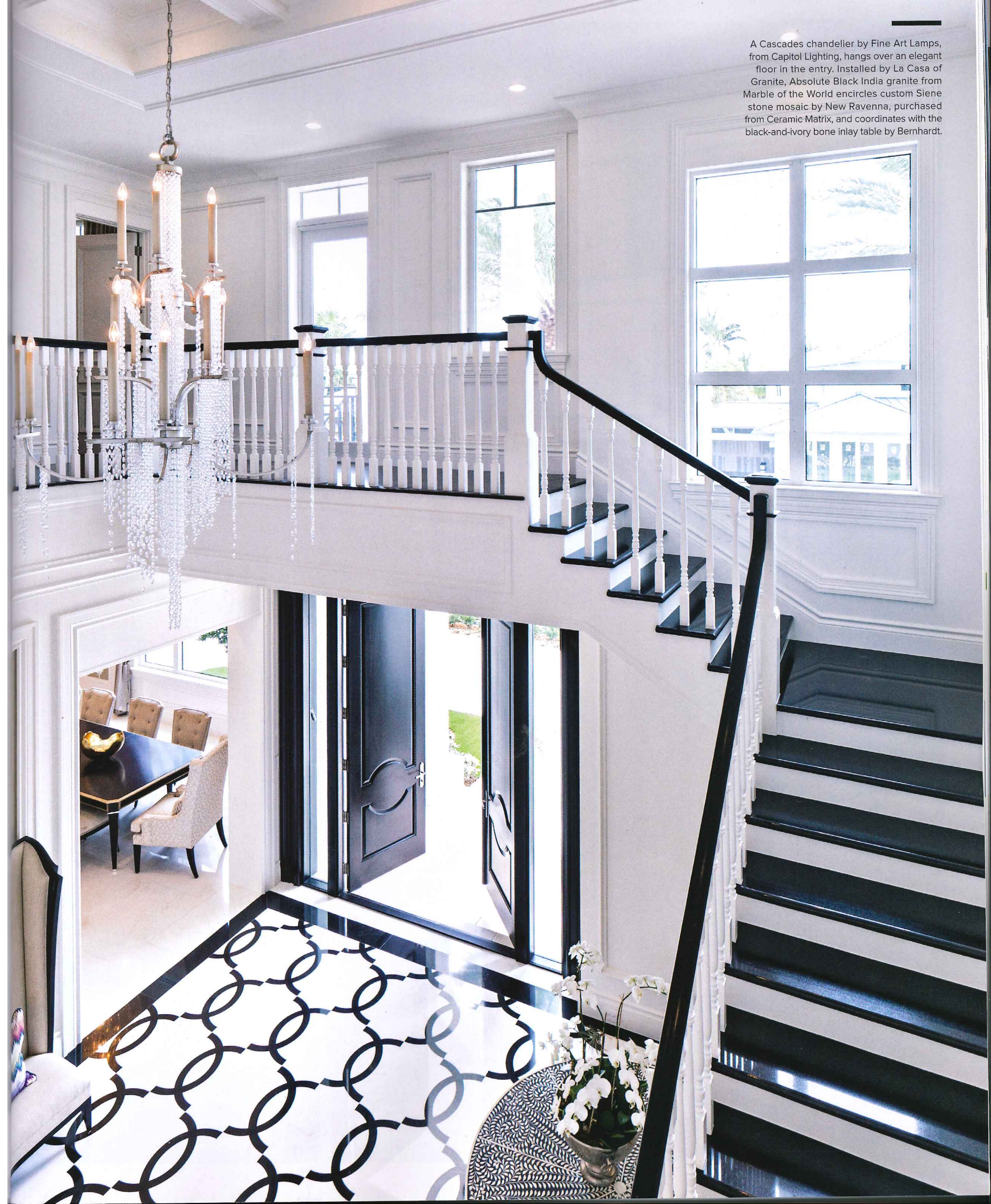
A Cascades chandelier by Fine Art Lamps, from Capitol Lighting, hangs over an elegant floor in the entry. Installed by La Casa of Granite, Absolute Black India granite from Marble of the World encircles custom Siene stone mosaic by New Ravenna, purchased from Ceramic Matrix, and coordinates with the black-and-ivory bone inlay table by Bernhardt.

The relaxed exterior of this West Indies-style home by architect Randall Stofft only hints at the grandeur inside. The residence’s massing that features stepped-back areas on the façade also helps disguise its considerable square footage. Land Designs of Southern Florida framed the front with two date palms.